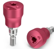
Encode® Emergence Healing Abutment