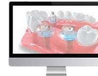
CAD/CAM Workflow Systems

Generating implant pull-through with efficient, fully integrated tooth replacement workflow solutions