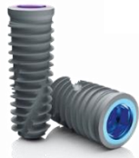
T3® PRO Implant