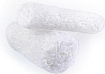
RegenerOss® Bone Graft Plug