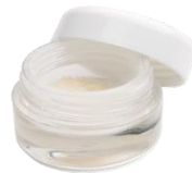
Puros® Allograft Products