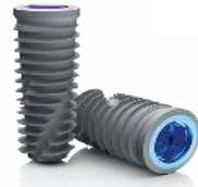
T3® PRO Implant