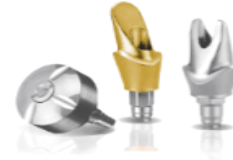
Full range of abutments, copings, and analogs