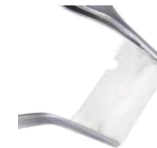
Biotivity™ A/C Plus Membrane

Expanding the pool of patients who can qualify for tooth replacement