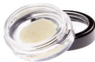
RegenerOss® Cortico-Cancellous Particulate